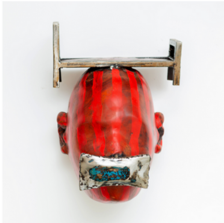
Le migrant Wood and metal 28 x 20 x 19 cm