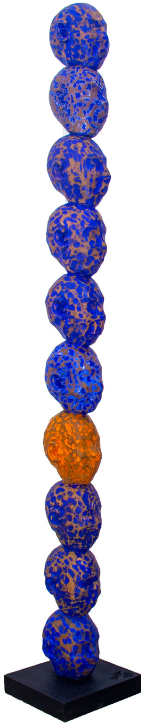
La Lignée Wood and metal 208 x 18 cm