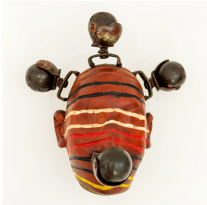
ça roule Wood and metal 30 x 28 x 25 cm