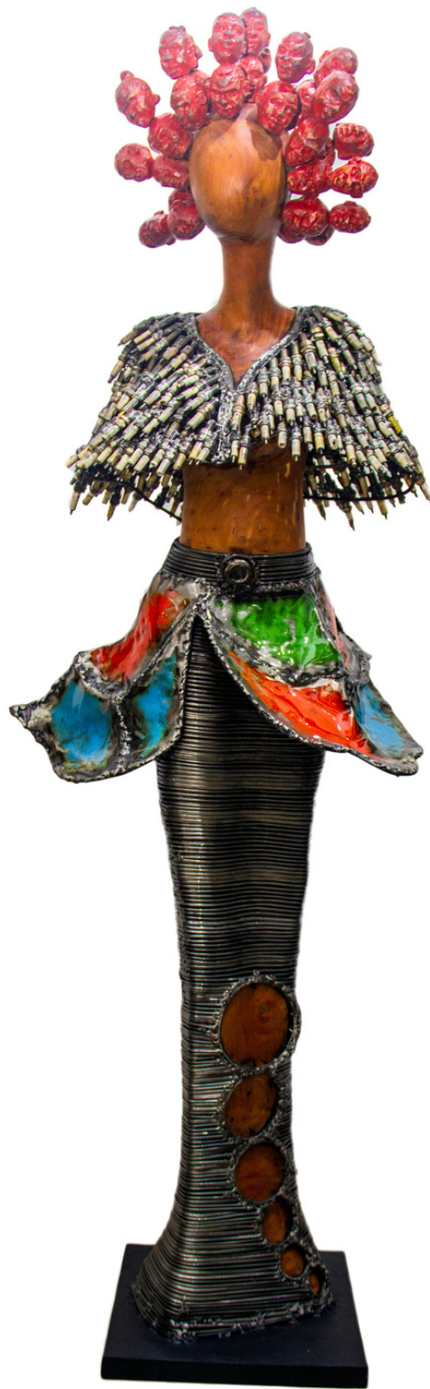
La PDG Wood and metal 183 x 59 cm